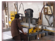
Facilities - Welding