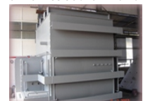
Melt Furnace for Consarc, UK