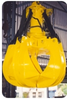
GRAPPLES EXPORTED TO UK

Design, Development, Fabrication & Supply of Specialized Fabricated Plants, Structures, Equipments in Stainless Steel, Carbon Steel & Alloy Steel under any third party inspection.