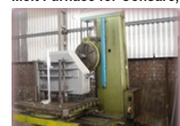
Facilities–HBMachine 80 Dia