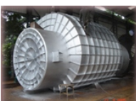
Vapour Saperator for Alfa