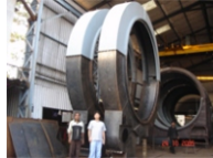
Chamber for Consarc, UK