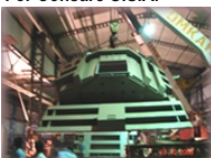
24T job being loaded