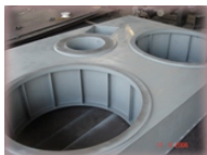
For Consarc U.S.A.