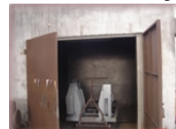
Facilities – Shot Blasting