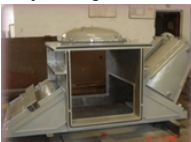
Mid section for Consarc, UK