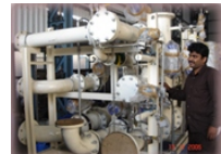
Skid for Aquatech