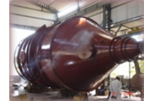
32 Tonnes Job for Alfa Laval