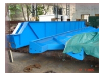
21T furnace for Consarc