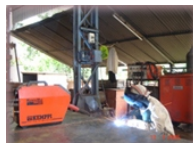
Gear Cover for TSK, Japan